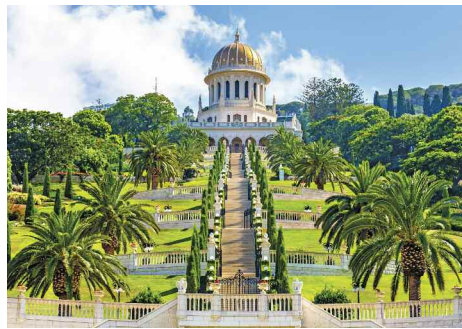
Bahá'í World Center, Haifa