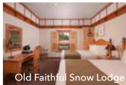
Old Faithful Snow Lodge