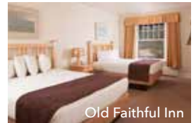
Old Faithful Inn