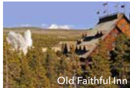
Old Faithful Inn

Each offers comfortable lodging and modern amenities.